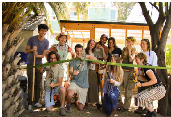
Co-ops cut the ribbon at Garden Hub Opening Day Celebration.

A lot has changed in the BSC since I first meandered past the Central Office, arms filled with my belongings, on my way to becoming the die-hard co-oper I am today. In 2020, amid my senior year, a global pandemic rocked the very core of the organization. The effects of which still reverberate through the membership and the Central Office. Despite all the change, what has stayed the same, is the generations of co-ops, current members and alumni alike, that have sustained, molded, and stewarded the BSC.