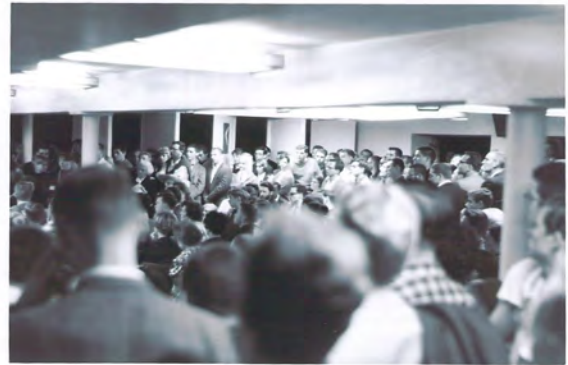
HUAC planning meeting at Barrington Hall, Berkeley.